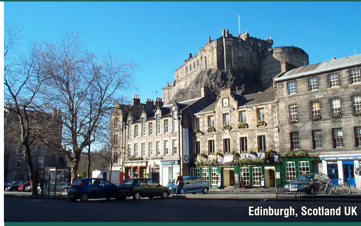
Edinburgh, Scotland UK